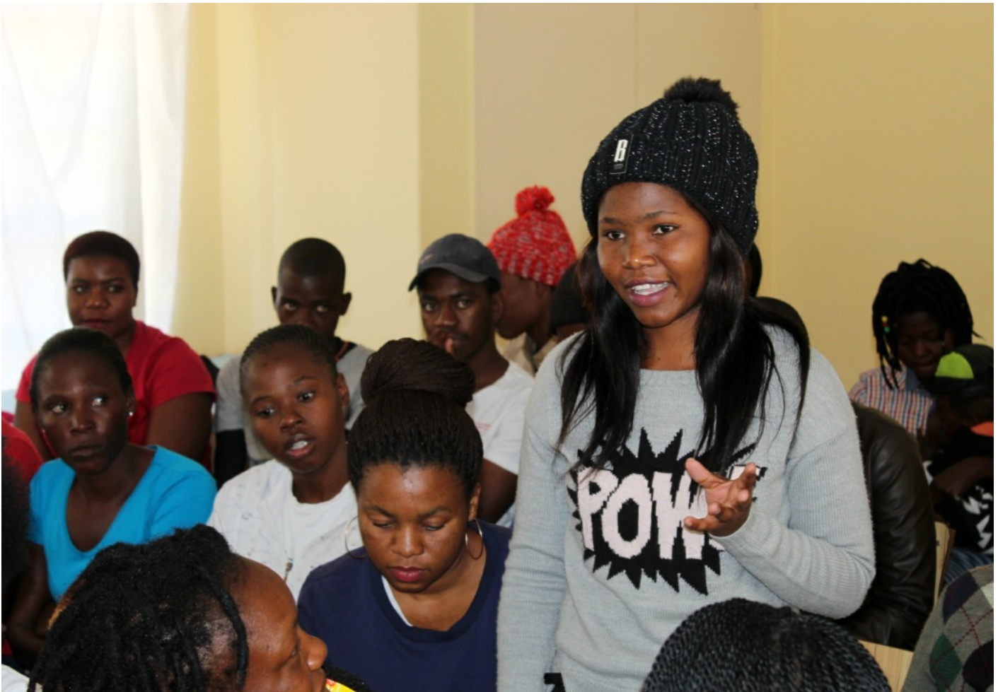
This young person makes a contribution during a meeting. Promoting youth participation was a key focus for CYDT in 2019

Generally, issues limiting youth participation in the province are crosscutting. There are structural norms and traditions that continue to inhibit youth engagement and participation in local communities considering that Matabeleland South is patriarchal in nature and surrounded by a number of traditional shrines which emphasizes on observance of traditional norms and culture. Many at times youths are left out on traditional functions and court hearings, making them a useless stakeholder yet our elders look upon them as future leaders. The questions remain to say where will these youths learn from.