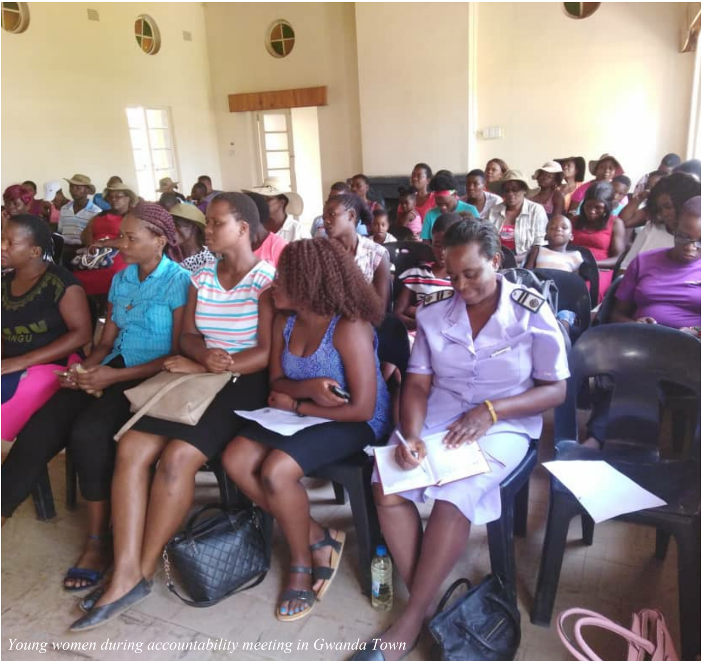
Young women during accountability meeting in Gwanda Town

Holding separate young women social accountability forums managed to entice them to be active advocates for improved social service delivery in their districts. This can be further attested by their active role in conducting local level service delivery advocacy campaigns such as #ImprovedAcces2Water – Plumtree and #Right2Shelter- Gwanda ward 4.