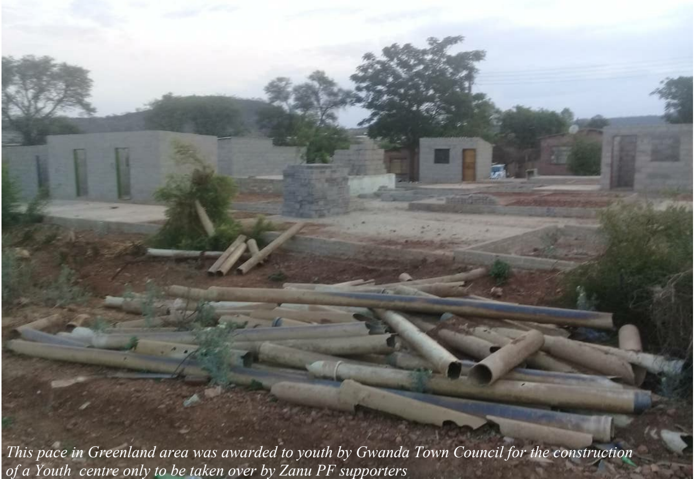
This pace in Greenland area was awarded to youth by Gwanda Town Council for the construction of a Youth centre only to be taken over by Zanu PF supporters

CYDT managed to hold anti-corruption forums throughout the year and discussions were around ending corruption that continue to limit service provision at local authority level. These forums gave policy makers and other local government stakeholders opportunity to denounce corruption and make commitments towards fighting corruption that has eroded hope around improved service delivery.